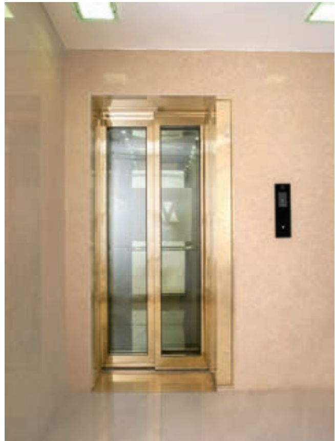
Wittur's Quartz-i home elevator

based on the Stellar platform that delivers outstanding value while maintaining the same commitment to quality for which Wittur is known. Customers, thus, may choose a quality Wittur door that is priced just marginally above locally fabricated contraptions that pass for elevator doors.